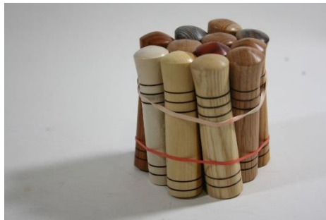
Various Wood Needle Boxes – Bob Schasse