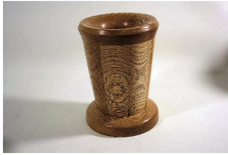
Oak Stave Vase – Luke Shepherd