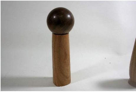
Walnut Sphere/Red Oak - Ray Swartz