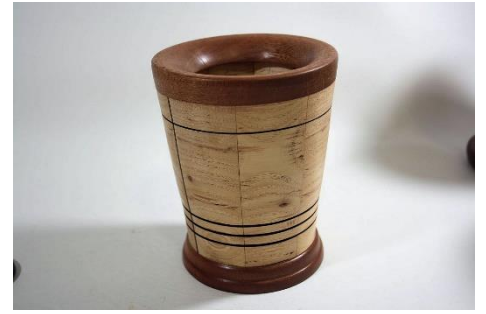
Oak Stave Vase – Oak, Cherry, Walnut- Luke Shepherd