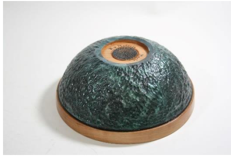
TOM- Pointed Textured Bowl Bottom