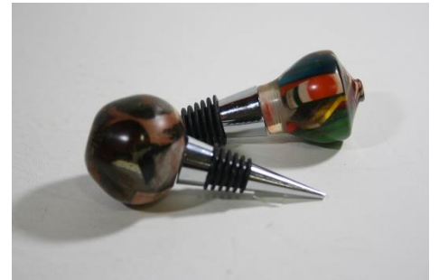
Wine Bottle Stoppers (PC) – Bob Holtje