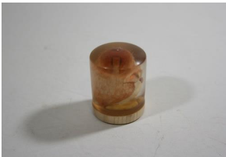
Owl Wine Bottle Stopper-Bob Holtje