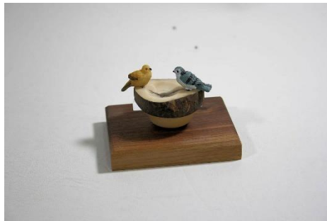
Bird Bath (PC) Tagua Roy Carlson