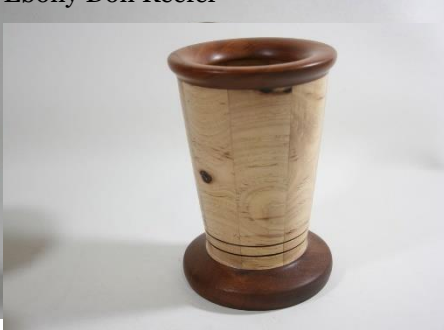
Oak Stave Vase – Oak, Walnut – Luke Shepherd