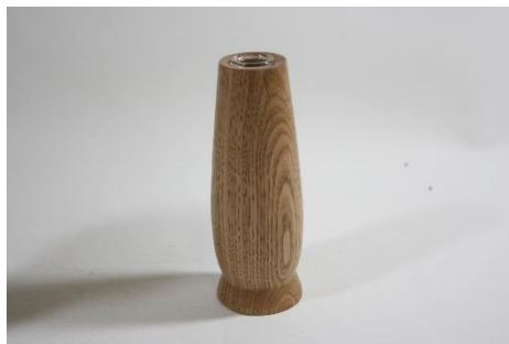
Red Oak Vase – Ray Schwartz