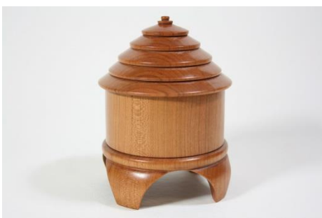
Nim Batchelor – 5” Cherry Saltcatty