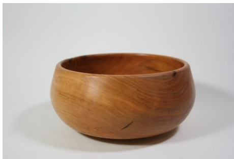
Jim Yarbrough – 7” Cherry Bowl