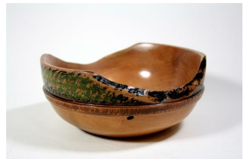
Harry Sample – 7” Dogwood Textured Bowl