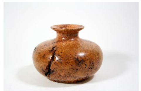
Geoff Purser – 4” Cherry Hollow Form