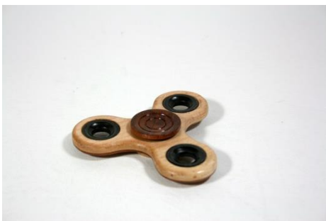
Jim Duxbury 3” Mahogany & Maple Spinner