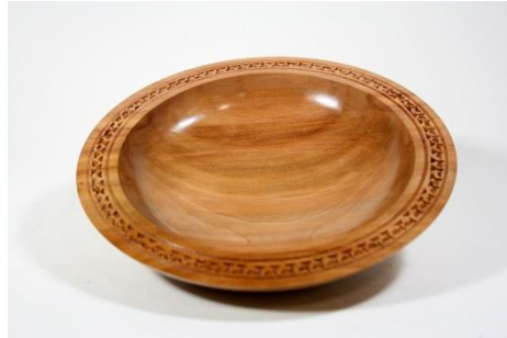
Rita Duxbury – 8” Sycamore Bowl Textured Rim