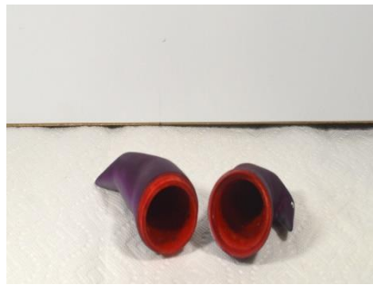
TOM- A Purple Box (2 pieces)