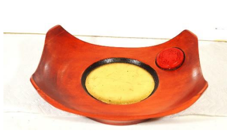
Maple/Stained Plate/Gold Leaf - Don Keefer