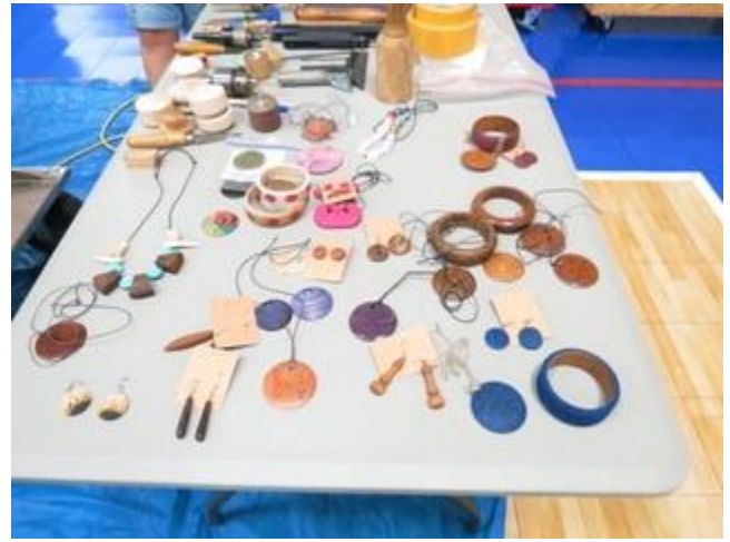
Samples of Scarlett's Work