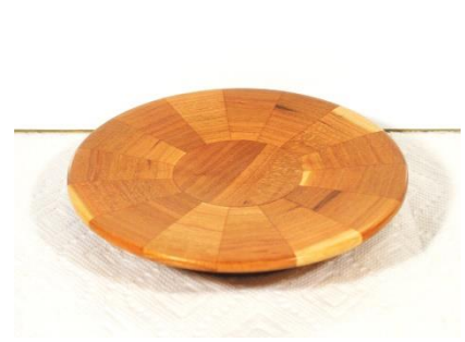
Cherry Segmented Tray – Luke Shepherd