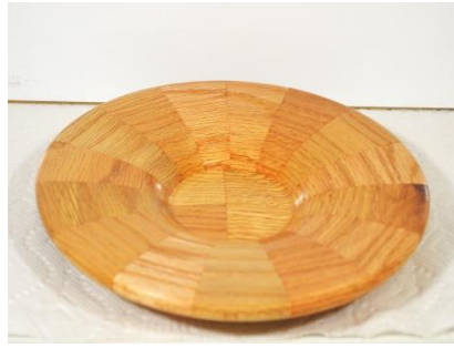
Oak Segmented Tray – Luke Shepherd