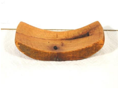
Oak Wing Bowl – Luke Shepherd