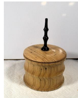
Ash Lidded Vessel – Jim Yarbrough