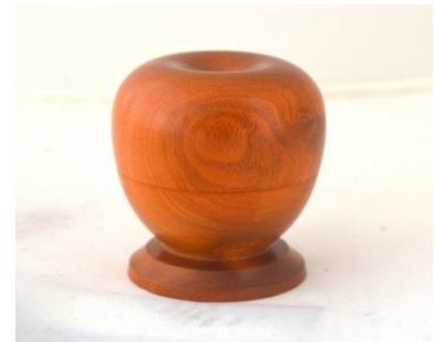
President's Challenge – September Chakte Viga Wood – Threaded Apple Box – Jerry Jones (not shown at meeting)