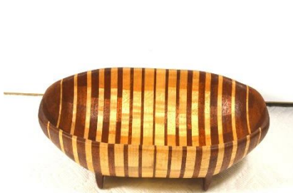
Maple and Sapele Graduated bread bowl - Don Keefer