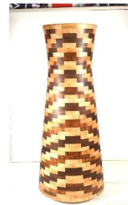
Maple/Walnut/Sapele Floor Vase Jason Lathrop About 30" tall