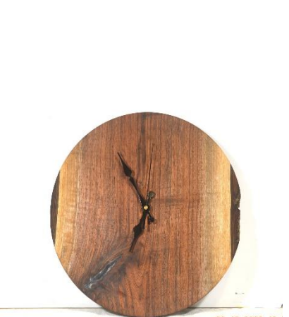
Walnut Clock – Lorien Deaton