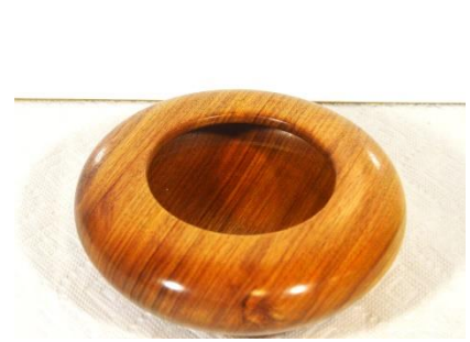
Canary Wood Bowl-Jim Terry