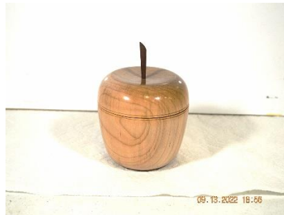
President's Challenge – September Maple/Walnut Apple Box – Jon Cowgill