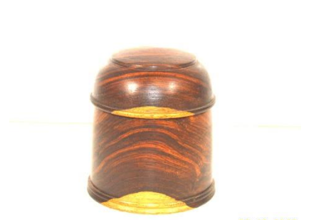
Cocobolo Box – Nick Poschl