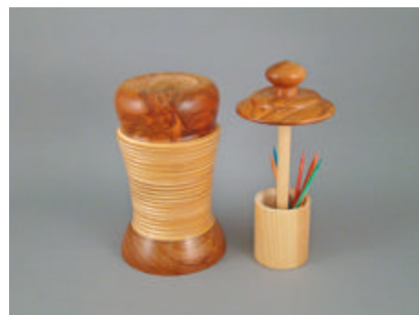
Gene Briggs - Cherry & Plywood Toothpick Holder