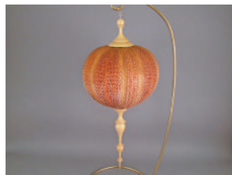
Jim Terry - Large Sea Urchin Ornament