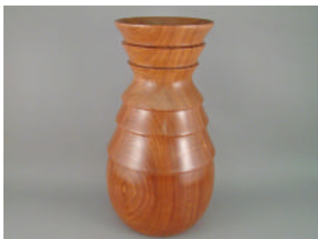
Gene Briggs - Walnut Vase