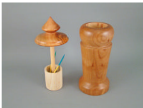
Gene Briggs - Cherry Toothpick Holder