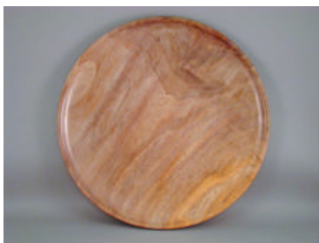
Carter Deaton - Walnut Platter