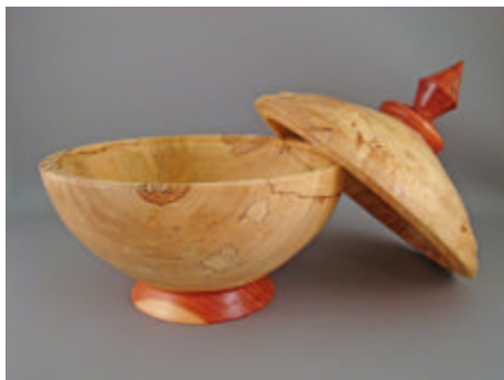
Doc Green - Willow Lidded Bowl