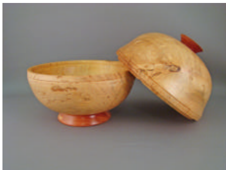
Doc Green - Willow Lidded Bowl