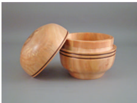
Carter Deaton -Dogwood Threaded Box