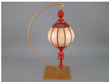
Jack Walters - Maple Walnut Cherry Bloodwood Ornament