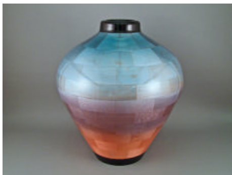
Jack Walters - Maple Segmented Vase