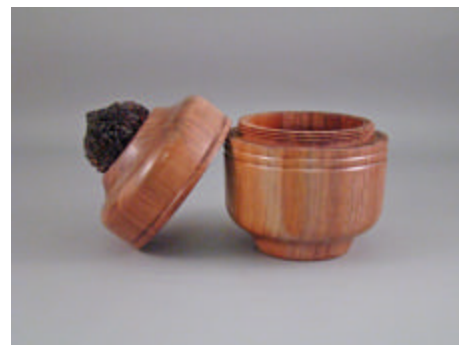
Carter Deaton - Walnut Threaded Box