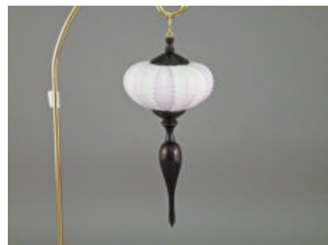
George Sudermann - Sea Urchin Ornament Ebony Finial