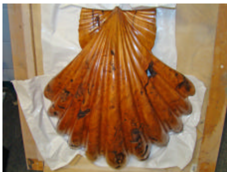
Casey Gloster - Cherry Burl Carved Scallop Shell