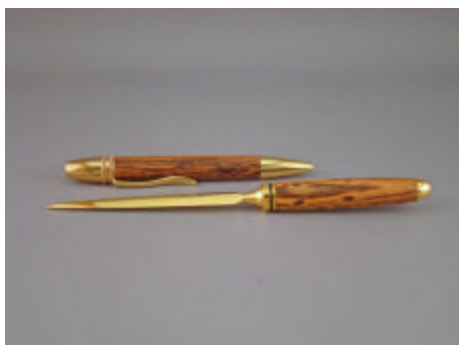
Jim Yarbrough - Bocote Pen & Letter Opener