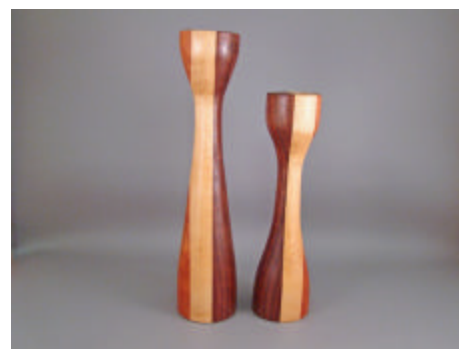
Dave MacInnes - Walnut/Maple/Tigerwood Candlesticks