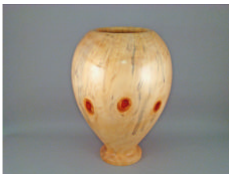
Earl Kennedy - White Pine Vase