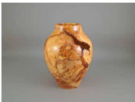
Alfred Thomas - Oak Burl Vase