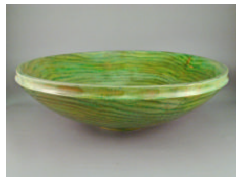
Earl Kennedy - Green Bowl