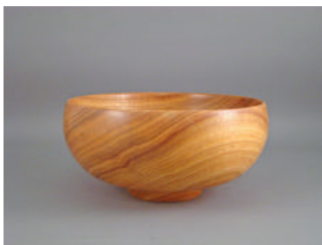
Carter Deaton - Canary Bowl