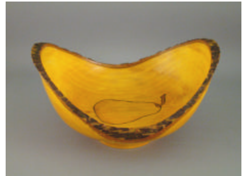
Carter Deaton - Natural Edge Pear Bowl