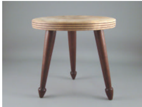
Lan Brady - Small Maple Stool