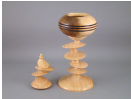
Bob Moffett - Poplar Elliptical Box