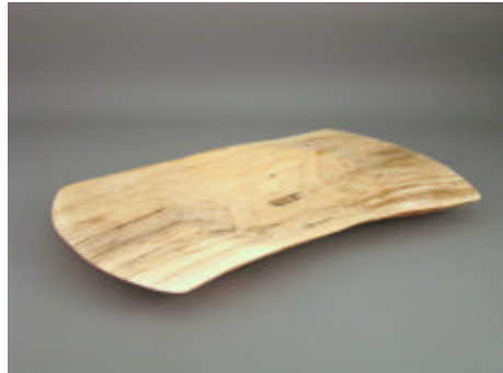
Carter Deaton - Maple Platter