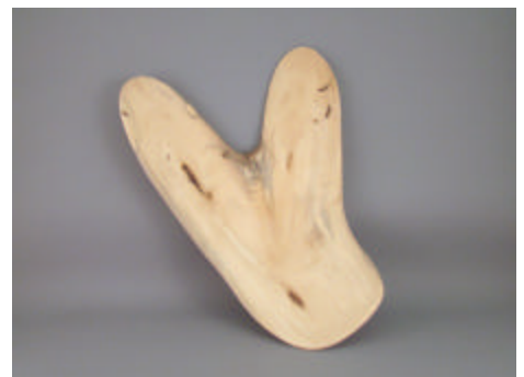
Earl Kennedy - Turned Poplar Crotch