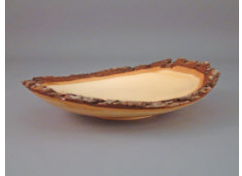
Jim Terry - Natural Edge Bradford Pear Bowl