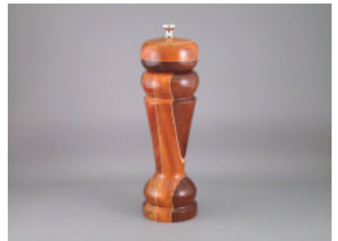
Gene Briggs - Walnut & Mahogany Peppermill