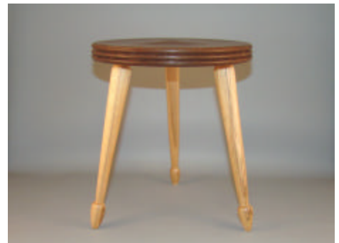
Lan Brady - Small Walnut Stool