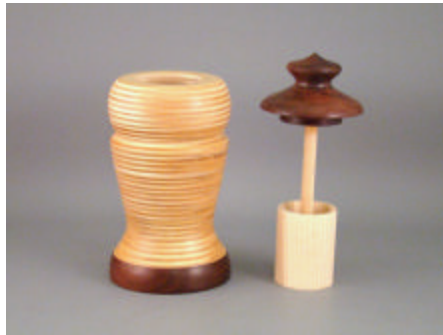
Gene Briggs - Plywood & Walnut Toothpick Holder