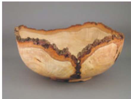
Alfred Thomas - Natural Edge Oak Burl