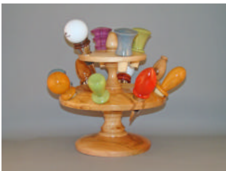
Earl Kennedy - Bottle Stoppers