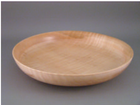
Carter Deaton - Maple Bowl