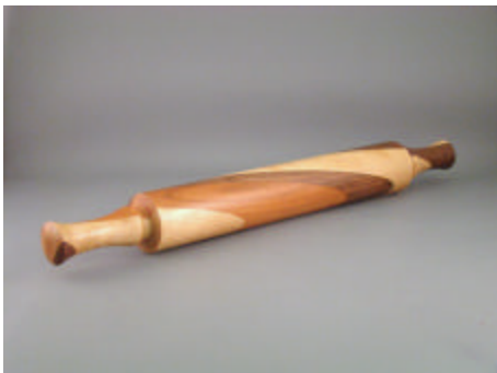
Dave MacInnes - Tigerwood/Birch/Walnut Rolling Pin