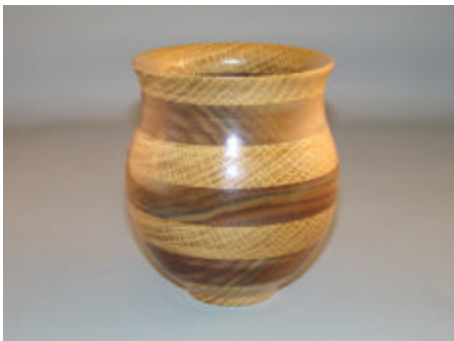
Carter Deaton - Oak & Walnut Bowl