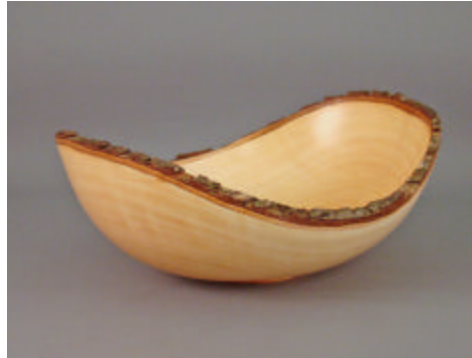
Jim Terry - Natural Edge Bradford Pear Bowl