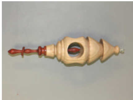
Robert Green - Maple & Bloodwood Lamp Ornament