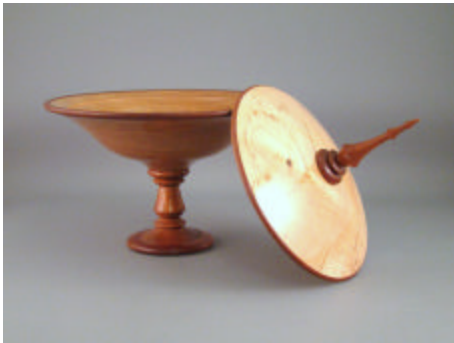
Earl Kennedy - Maple & Mahogany Lidded Box