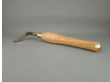
Page Cullen - Tool