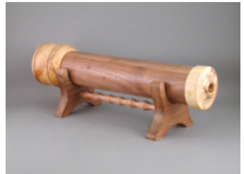
Carter Deaton - Walnut & Cherry Kaleidoscope