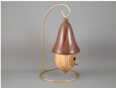
Bob Moffett - Walnut & Maple Birdhouse