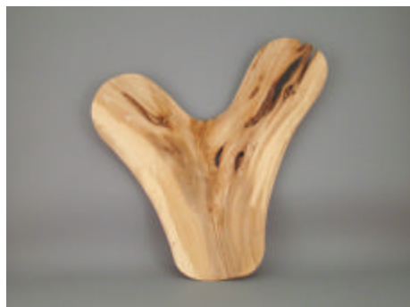
Earl Kennedy - Turned Crotch