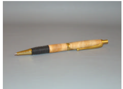
Jim Yarbrough - Maple Comfort Pencil