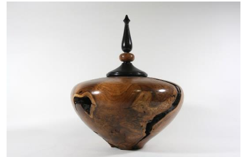
Brian Guhman – Mesquite & African Blackwood Vessel