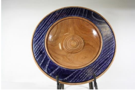
Bob Moffett – 14” White Oak Platter