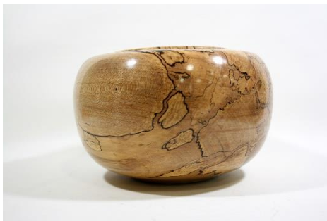
Harry Sample – Turner-of-the-Month 6” Maple Bowl