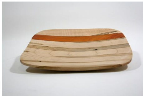
Jimmy Murray – 8” Maple/Padauk Plate