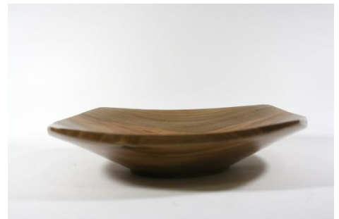
Jay Mullins – 10” Elm Winged Platter