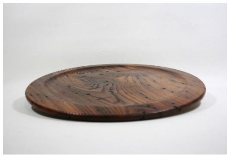
Jim Yarbrough – 14” Wormy Chestnut Platter