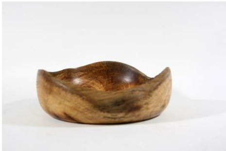
Greg Ford – 7” Oak Natural Edge Bowl