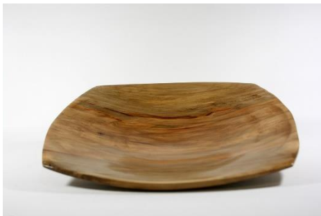
Jay Mullins – 12” Elm Winged Platter