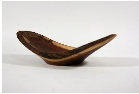
Greg Ford – 6” Cedar Oblong Bowl