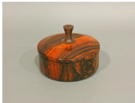
Joe Ghezzi – Cocobolo & Walnut Lidded Box