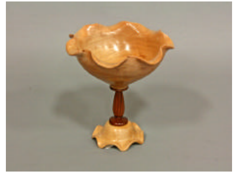
Earl Kennedy – Scallop Edge Goblet