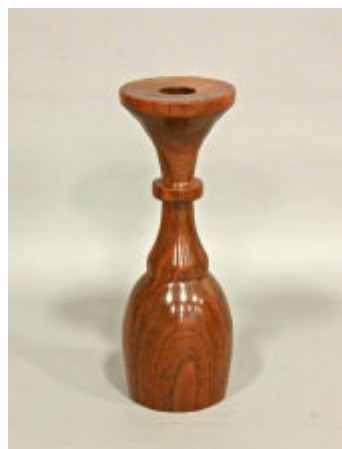
Clyde Mosley – Walnut Candlesticks