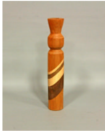
Dave MacInnes – Cherry, Burch, Walnut Candlestick