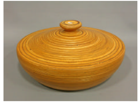
Floyd Lucas – Plywood Bowl