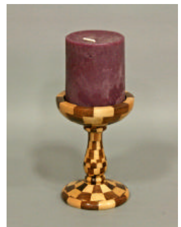
Floyd Lucas – Walnut & Maple Candlestick