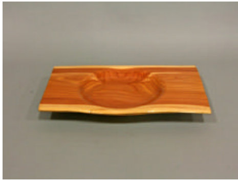
Doc Green – Cedar Square Bowl