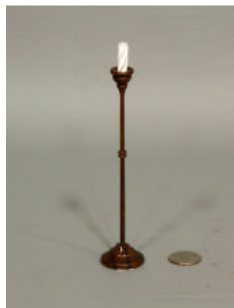
Earl Kennedy – Miniature Candlestick