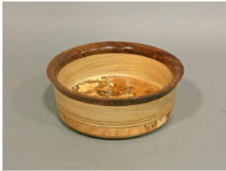
Bert Rau – Spalted Sycamore & Walnut Layered Bowl