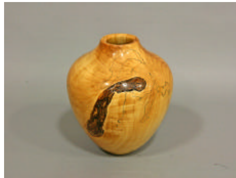
Chuck Waldroup – Vessel (unknown wood)