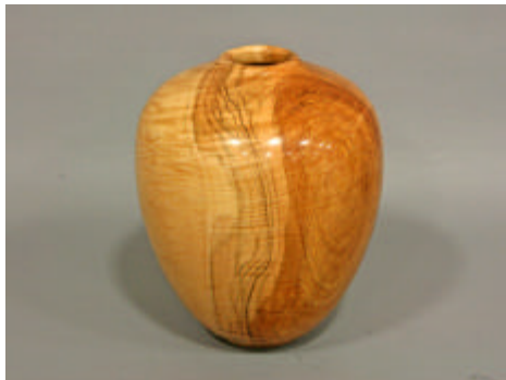
Chuck Waldroup – Maple Vessel