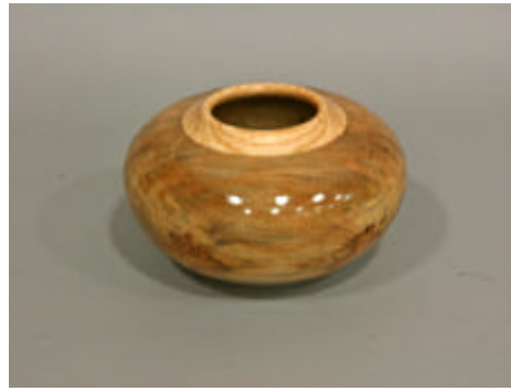
Doc Green – Sycamore Bowl w/ Oak Rim