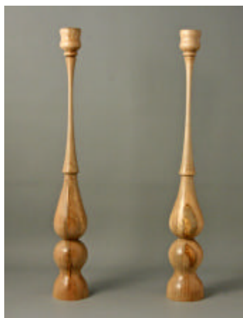
Jim Terry – Maple Candlesticks