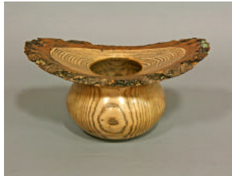
Earl Kennedy – Natural Edge Hollow Form