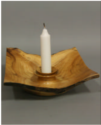
Doc Green – Locust? Natural Edge Candle Holder