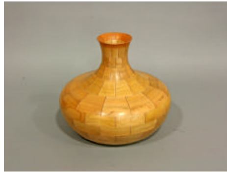
Floyd Lucas – Maple Segmented Vase