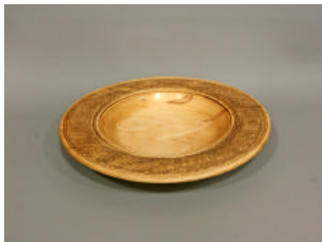
Lan Brady – Maple Platter