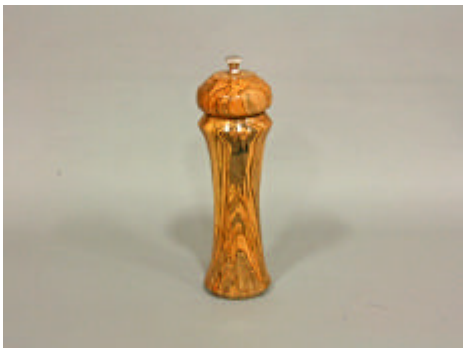
Jim Yarbrough – Ambrosia Maple Pepper Mill