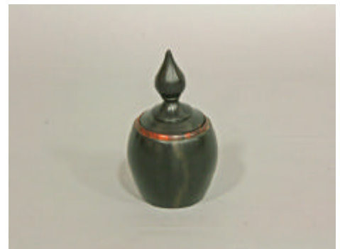
Jjoe Ghezzi – Gabon Ebony & Cocobolo Finial Box