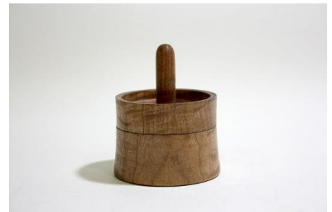
Art Fox – Ring Holder Box