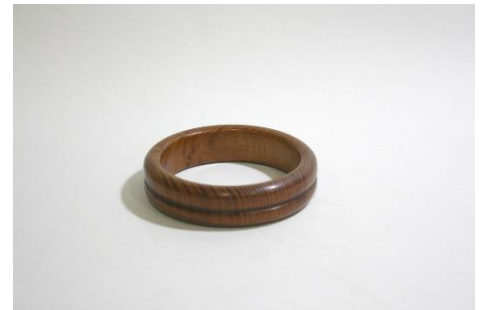
Dallas Stokes – Osage Orange Bangle