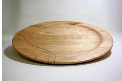
Kenny Reyenthal – Maple Platter w/ Inlay