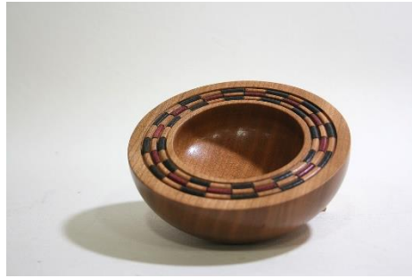
Rita Duxbury – Cherry Bowl with Basketweave