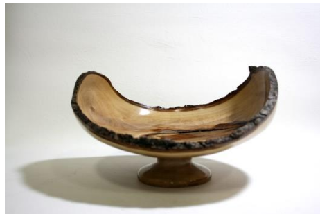
Earl Kennedy – Natural Edge