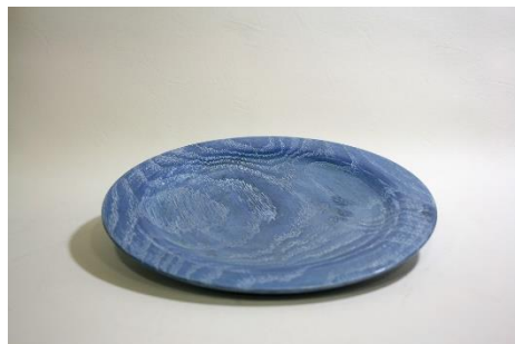
Kenny Reyenthal – Oak Plate