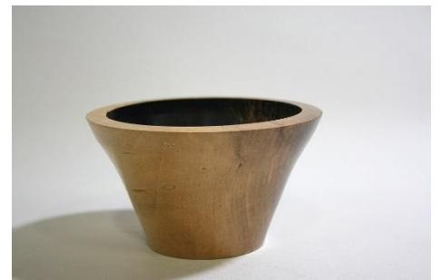
Rita Duxbury – Maple/gesso, gold Maple bowl