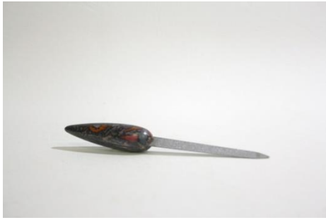
Earl Kennedy – Maple & Veneer Finger Nail File