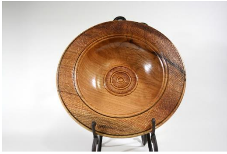
Bob Moffett – 12” White Oak Platter