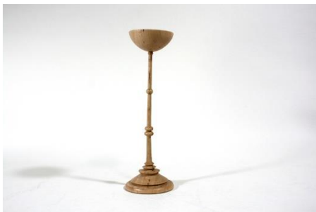
Earl Kennedy – Maple Goblet