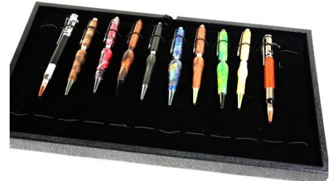
Wayne & Casey Dumas – Wood Acrylic Pens