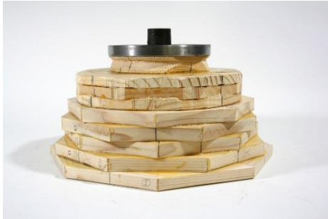
Luke Shepherd – Pine Bowl glue-up