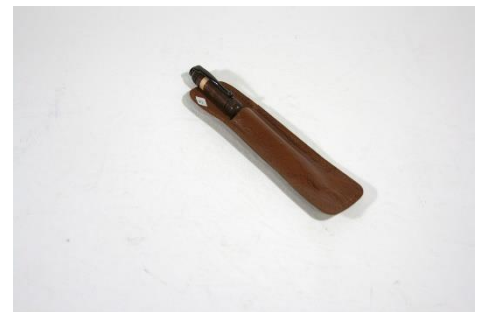
Bob Poole – Maple/Black Walnut Pen