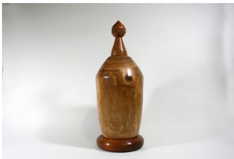
Dallas Stokes – Cherry/Mahogany Cremation Urn