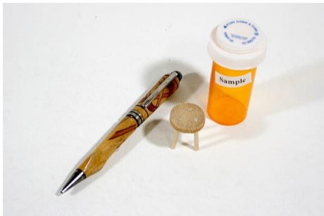
Jim Duxbur – Maple & Cherry Pen and “Stool Sample”