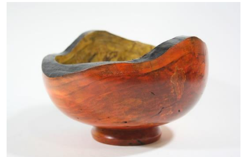
Earl Kennedy – Wormed Maple Colored Bowl