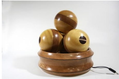
Jim Duxbury – Yellowheart & Cherry Rotating Balls