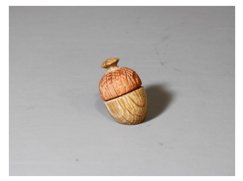
Jim Barbour – Oak Maple Box