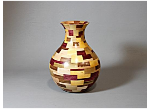
Floyd Lucas - Segmented Vase