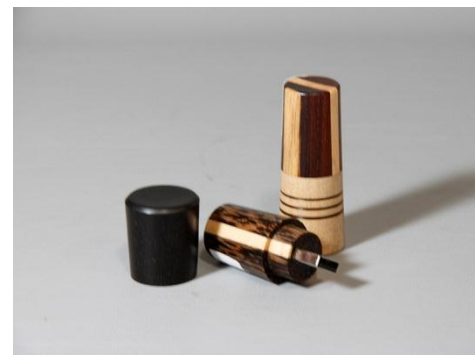
Nim Batchelor – Flash Drives Palm/Maple/Ebony, Rosewood/Maple