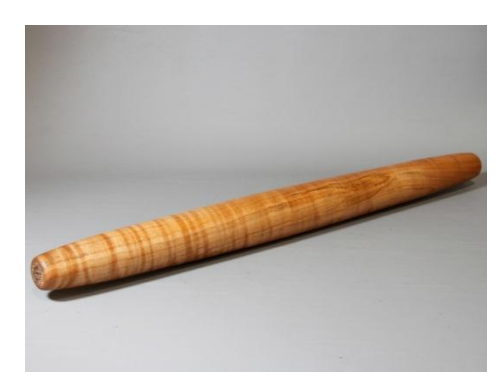
Jim Raine – Maple French Rolling Pin