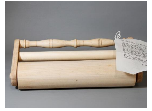
Clyde Mosley – Maple One-Hand Rolling Pin