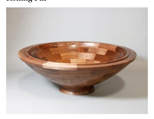
Dean Hutchins – Walnut Segmented