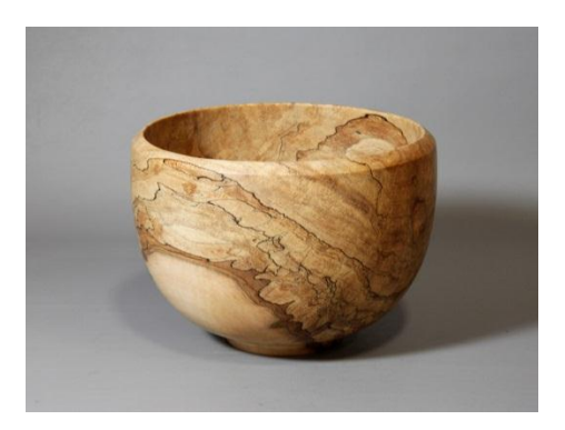
Pat Lloyd – 6" Red Maple Burl