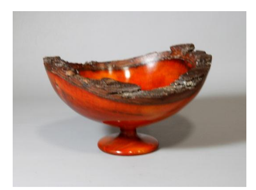
Earl Kennedy – Dyed Pecan Natural Edge