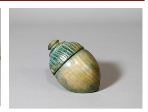
Jim Barbour – Maple Acorn Box