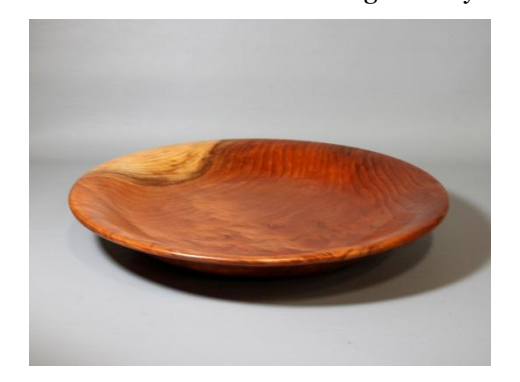
Earl Kennedy – Redwood Platter