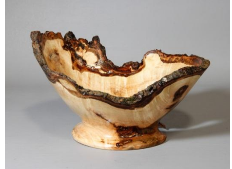
Matt Larson – Maple Natural Edge