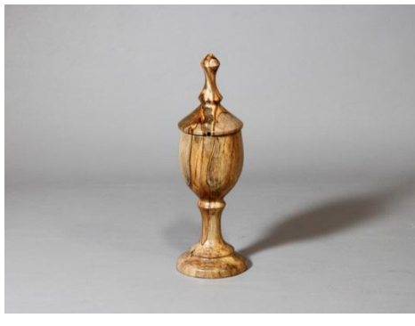
Jim Yarbrough – Ambrosia Maple Lidded Box