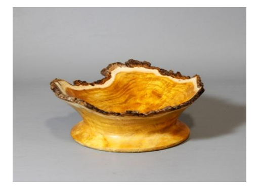
Matt Larson – Maple Natural Edge