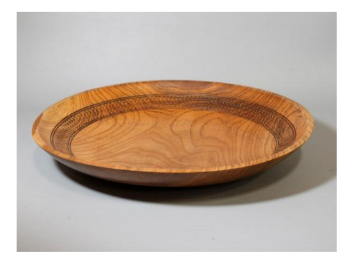
Lan Brady – 14" "Triple M" Elm