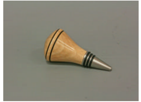
Larry Snead – Apple Stopper