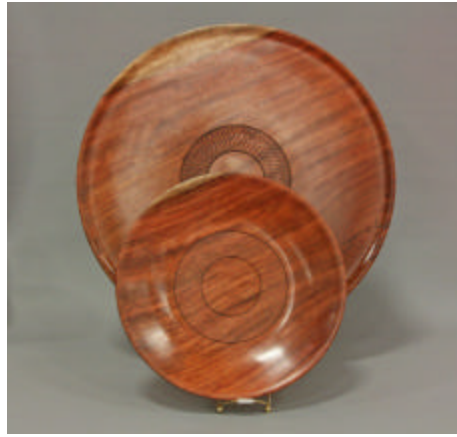
Jim Barbour – 24” Bubinga Platter & 12” Bowl