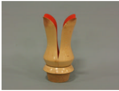
Bert Rau – Large Inside-Out Stopper