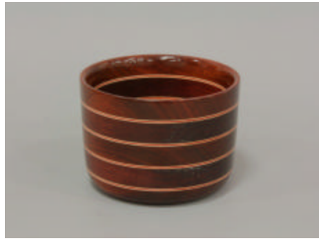
Jim Raine – Bloodwood/Purpleheart Candy Dish