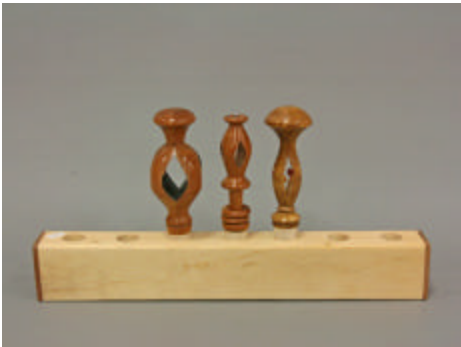
Bert Rau – Inside-Out Stoppers