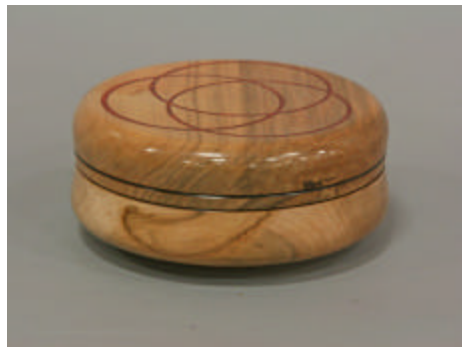
Doc Green – Maple Multiaxis Box