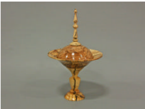
Doc Green – Apple/Sycamore Pedestal Bowl