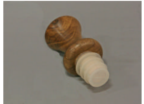
Jim Yarbrough – Plum Stopper