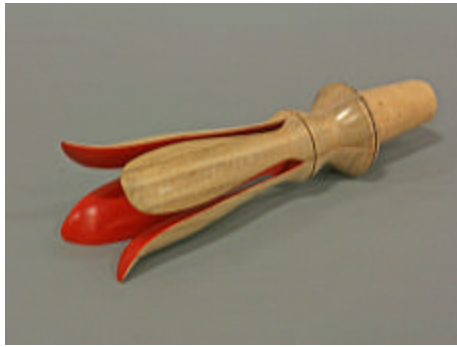
Bert Rau – Inside-Out Stopper