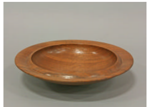
Jim Raines - Walnut Candy Dish