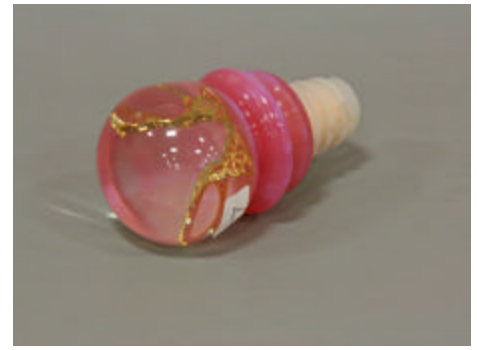
Wes Adams – Acrylic w/ Butterfly Stopper