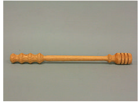
Gary Robinson – Oak Spurtle