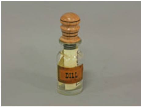
Doc Green – Ash Stopper