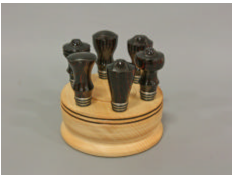
Jim Terry – 6 Dymondwood Stoppers