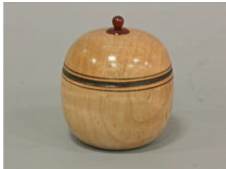
Earl Kennedy – Maple Box