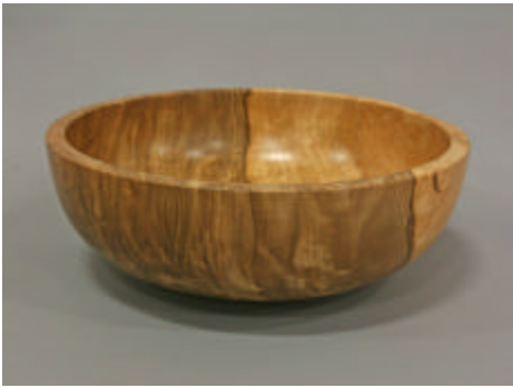
Jim Tuttle – Black Gum Bowl