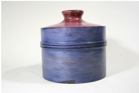
Bob Schasse – 7 Ambrosia Maple Beads of Courage Box