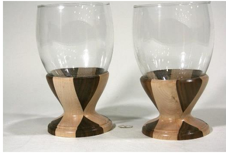
Jim Duxbury – 3” Maple Walnut Wine Glasses