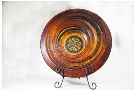
Bob Moffett – 17" Maple Offset Platter