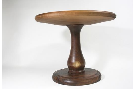
Larien Koontz – 12" Walnut Cake Stand