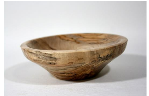
Kyrar Ford – Maple Bowl