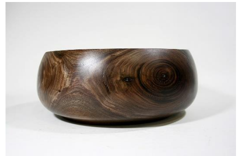
Geoff Purser – 10” Walnut Bowl