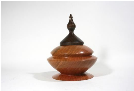
Turner-of-the-Month – Dallas Stokes