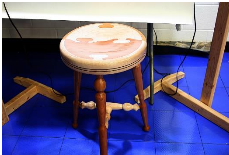
James Duxbury – 18” Cherry/Maple Puzzle Stool