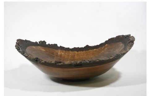
Bob Moffett – 17” Walnut Natural Edge Bowl