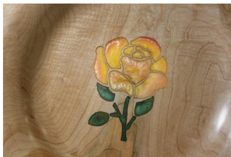
Close up of Louise’s Resin Rose