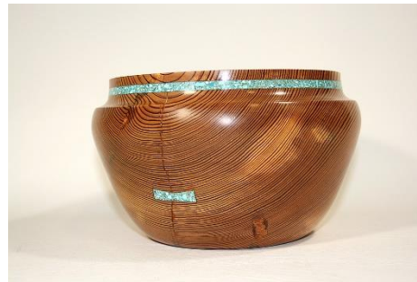
George Sudermann – 8” 250 year old Old Growth Pine & Turquoise