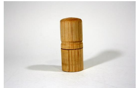
Greg Ford – Toothpick Holder