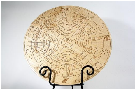
Nim Batchelor – Maple Ancestry Platter