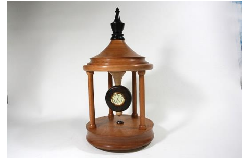
Nim Batchelor Cherry/Ebony Band Stand Clock