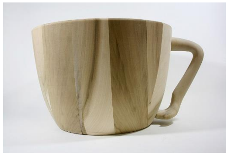
Brian Guhman – 18 plus inch Poplar Coffee Cup