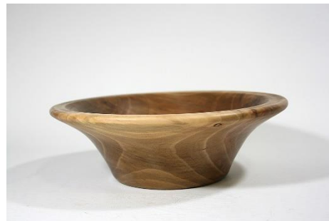
Jim Yarbrough – 8” Maple Bowl