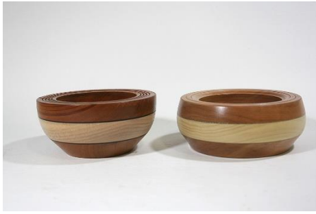
Rita Duxbury – 6” Laminated Bowls