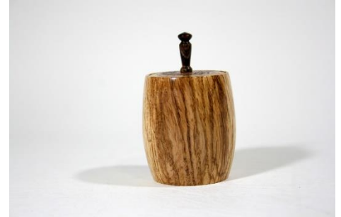
Jimmy Murrey – Oak/Cocobolo Box