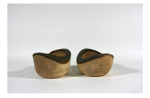
Tim Smith – 4" Maple Natural Edge Bowls