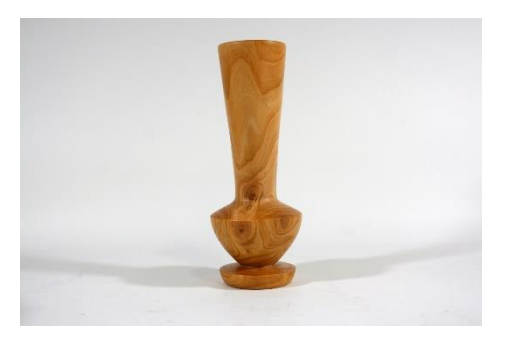
Jimmy Murry – 7" Peach Vase