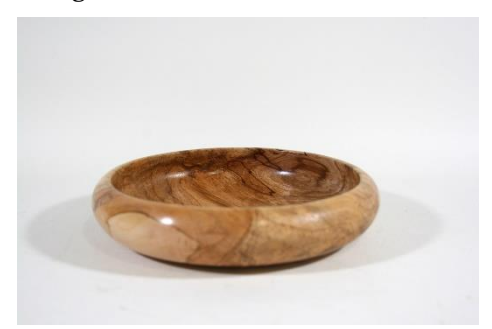
Greg Ford – 6" Japanese Maple Bowl