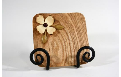
Earl Martin - 6" Oak Plate