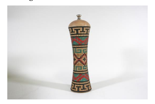
Nim Batchelor – 8" Maple Basket Weave Pepper Mill