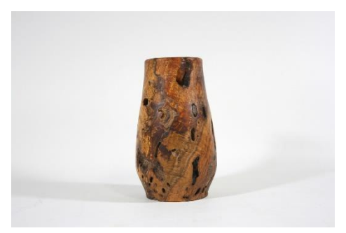
Jim Yarbrough – 6" Oak Burl Hollow Form