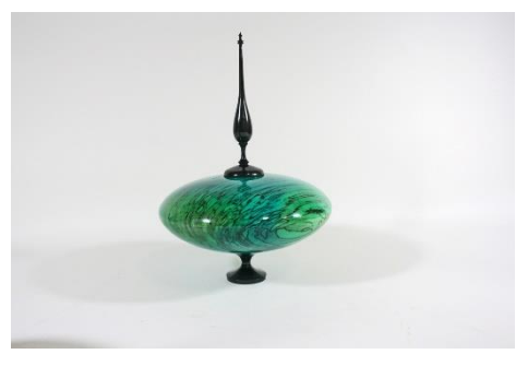
Jim Terry – 7" Maple Hollow Form