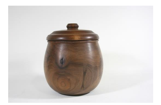
Jerry Jones – 6" Persimmon Beads-of-Courage Box