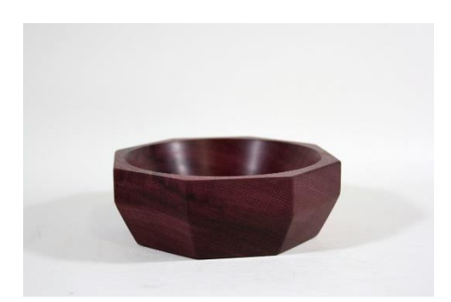
Roy Carlson – 6" Purpleheart Octagonal Box