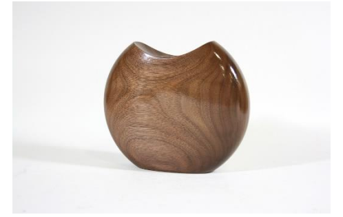
Steve Coley – 6" Walnut Flower Vase