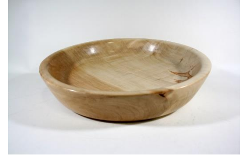
Greg Ford – 14" Maple Fruit Bowl