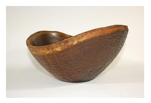
Steve Coley – 12" Natural Edge Walnut — Steve Coley – 8" Walnut Knot Bowl