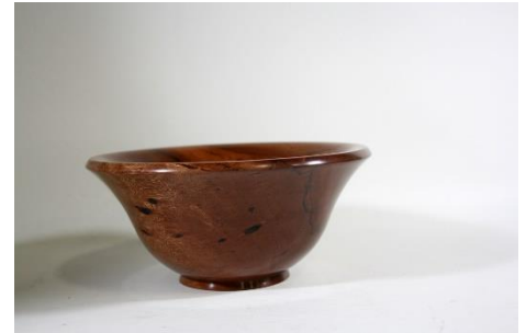
Earl Kennedy - Bowl