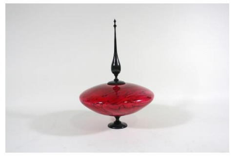
Jim Terry – 7" Maple Hollow Form