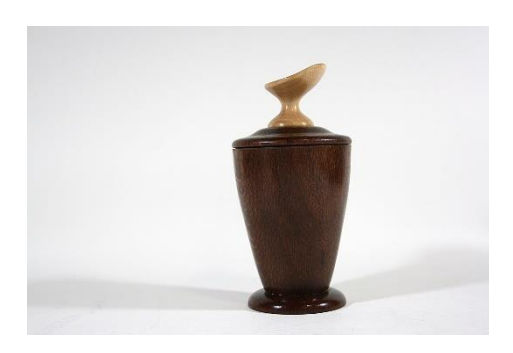
Jim Terry − Turner-of-the-Month − 7" Leopardwood Box