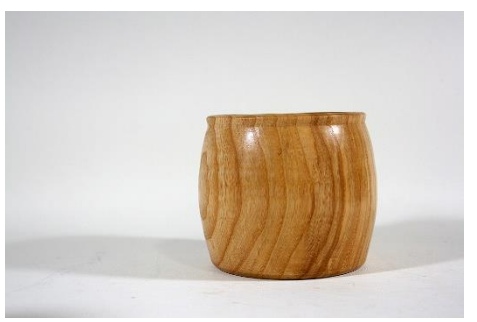
Jim Yarbrough – 5" Maple Bowl