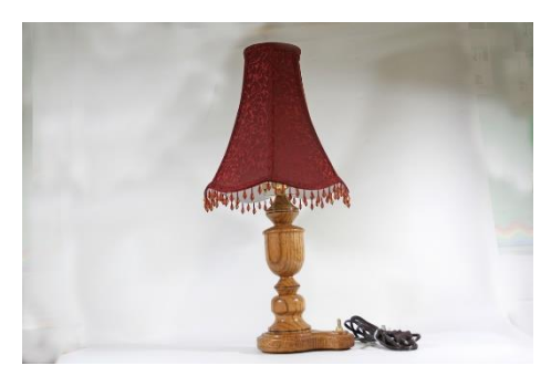
James Duxbury – 18" Red Oak Lamp