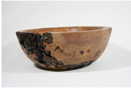
Earl Kennedy - Natural Edge Bowl