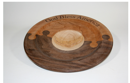
Dan Stanfield - Platter