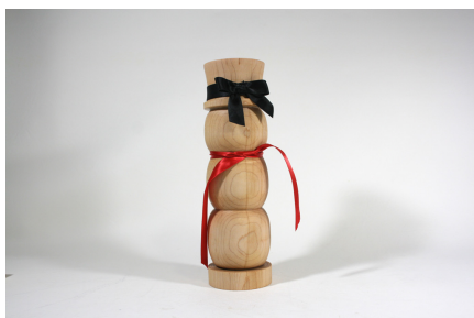
Carroll Kanipe - Snowman