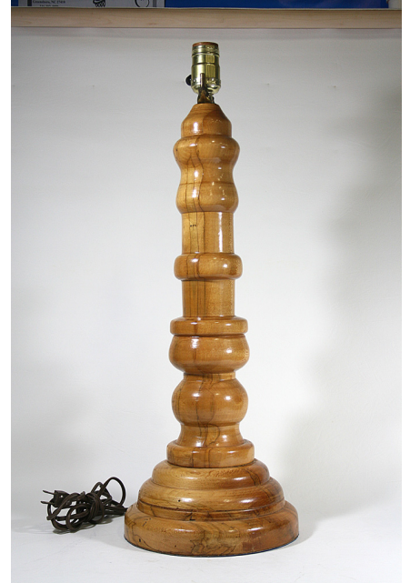
Caroll Kanipe - Lamp