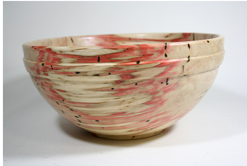
Bob Schasse - Box Elder Bowl