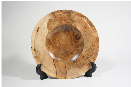
Rita Duxbury - Bowl