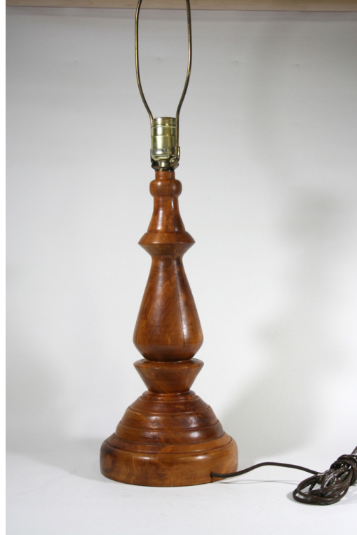
Caroll Kanipe - Lamp