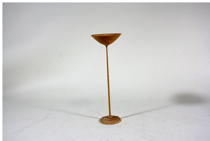
Earl Kennedy - Podlet