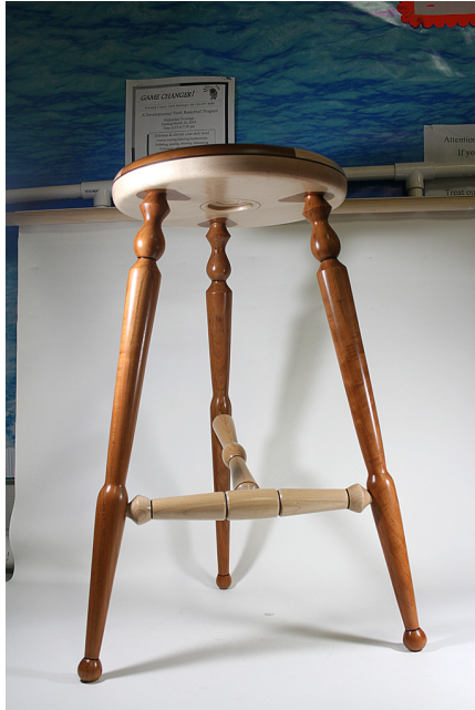
Jim Duxbury - Stool