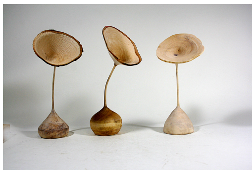
Lorien Koontz - Podlets