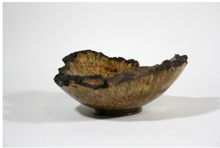
Earl Kennedy – Maple & Veneer Finger Nail File