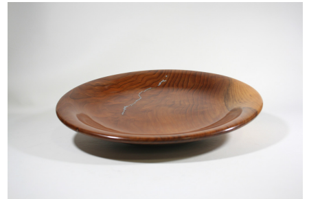
Earl Kennedy - Platter