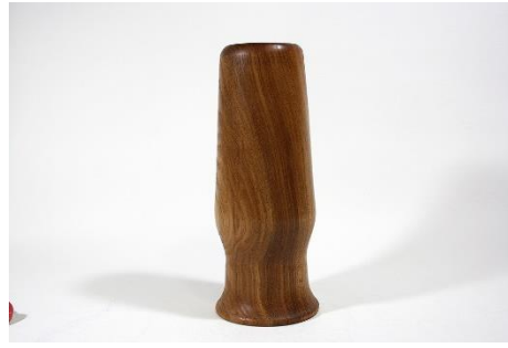
Jim Yarbrough – 9" Walnut Vase