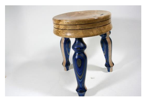
Jim Duxbury - 9" Maple & Died Burch