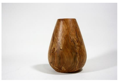
Geoff Purser - 6" Pear Vase