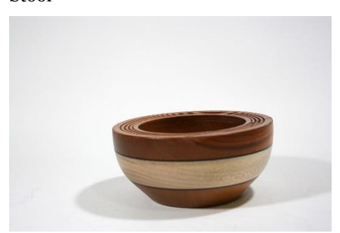
Rita Duxbury – 5" Mahogany & Maple Bowl