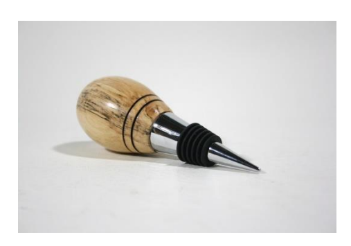
Jim Yarbrough -Spalted Maple Bottle Stopper