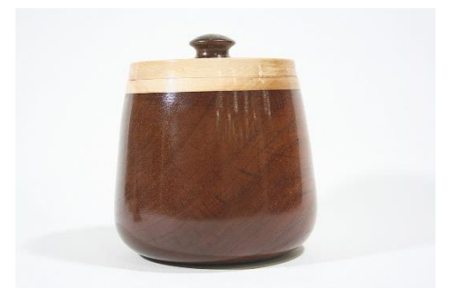
David Kelly – 5" Sweet Gum 7 Maple Box