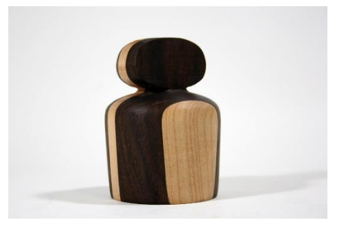
Dave MacInnes – Maple/Walnut Biscuit Cutter