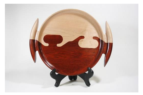
Jim Duxbury 12" Bloodwood & Maple Puzzle Tray