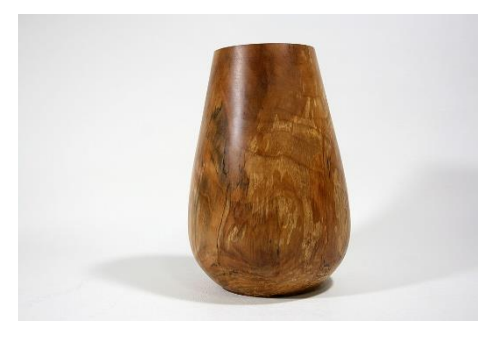
Geoff Purser - 8" Pear Vase