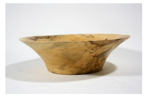
Greg Ford – Black Gum Tupelo Bowl