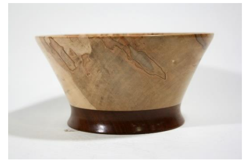
Greg Ford - Maple & Mahogany Bowl