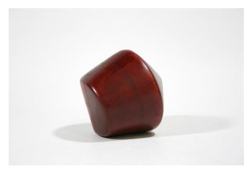
Roy Carlson – 3" Basswood Pentagonal Streptohedron