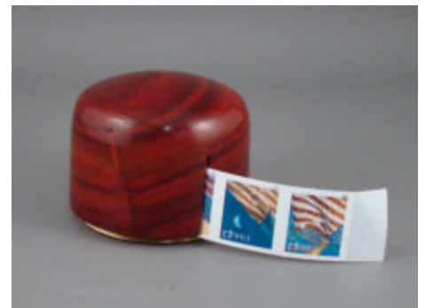
Jim Yarbrough – Padauk Stamp Holder