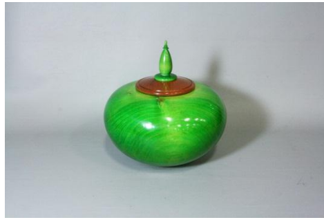
Earl Kennedy – Dyed Maple Hollow Form