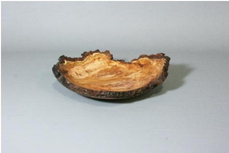
Carter Deaton – 7” NE Cherry Burl Dish