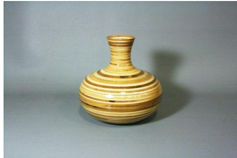
Floyd Lucas – Plywood Vase