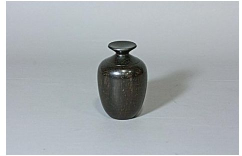
Nim Batchelor – 3” Rosewood Box