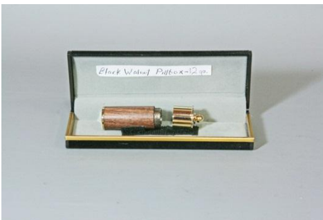
Larry Smith – Black Walnut Pill Box