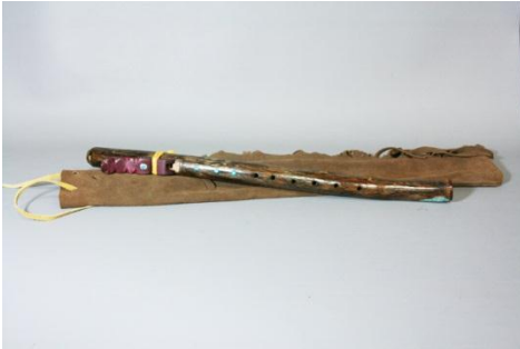
Hugh Grow – Purpleheart & Walnut Branch Flute