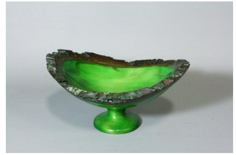
Earl Kennedy – Dyed Natural Edge Gu m