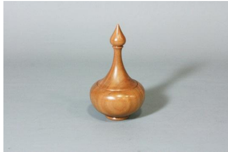
Nim Batchelor – 5” Cherry Box